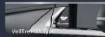
Vellfire HEV Type

Bring out the bold look to the surroundings in all ways.