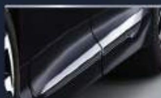
Side Skirt Modellista**