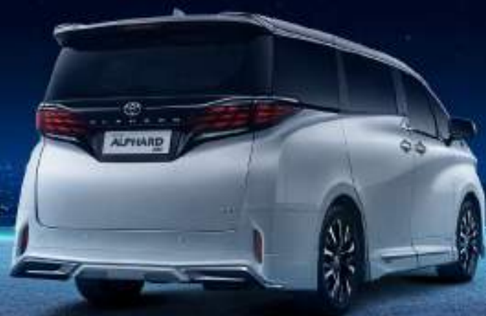
2.5 HEV Type*