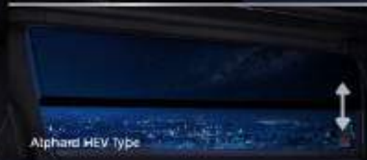
Alphard HEV Type

Experience convenience throughout every journey on Captain Seat (All Type) supported Detachable Smartphone-like Remote Control (All HEV Type) for private ambience and adjustable Rear Side Shade. (All Type)