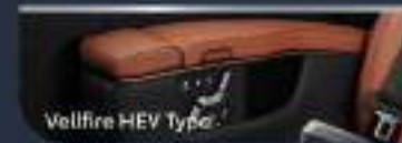
Vellfire HEV Type

Provide a Multifunction Table to support your productivity, complete with Detachable Smartphone-like remote control.