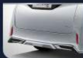
Rear Skirt Modellista*