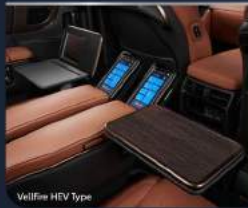
Vellfire HEV Type

Create a sense of ambience through the classy Interior Design, including the Steering Wheel, 12.3" TFT MID, 14" Head Unit Display, and Wireless Charger.