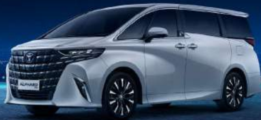
2.5 HEV Type

Experience sophisticated feeling in every path with Toyota All New Alphard HEV and bring sustainable impact for environment.