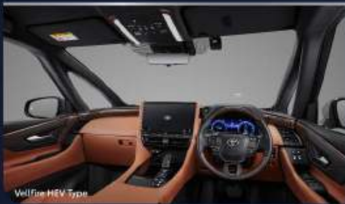
Vellfire HEV Type

Discover elegant ways to enhance your environmental contribution and enjoy a luxurious experience by exploring numerous new paths with Toyota All New Vellfire HEV.