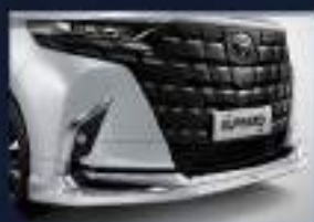
Front Skirt Modellista*

*Image shown are for illustration purpose only.