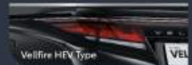
Vellfire HEV Type

The Vellfire emblem detail are designed to strengthen the extravagance look on every journey.