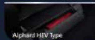
Alphard HEV Type

Indulge you in every journey with entertainment through bigger head unit. (All Type)