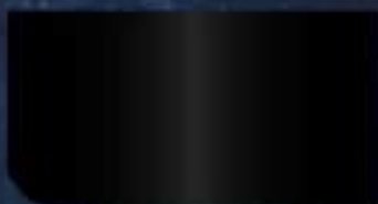
Black (Available for All New Alphard)