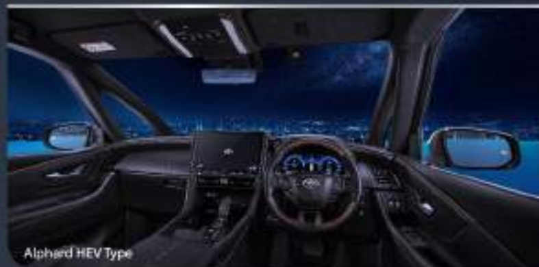
Alphard HEV Type