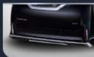
Rear Skirt Modellista**

*Available for Toyota All New Alphard All Type.