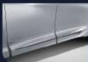
Side Skirt Modellista*