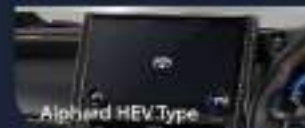
Alphard HEV Type

Comes with Interior Lighting, Ceiling Storage, and 14" Rear Seat Entertainment to provide you with ease along the journey. (All Type)