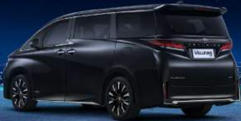
Vellfire 2.5 HEV Type