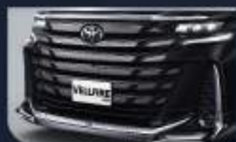
Front Skirt Modellista**