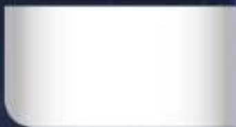
Platinum White Pearl