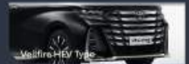
Vellfire HEV Type

Take your journey enjoyment to the next level with Power Long Slide Seat.