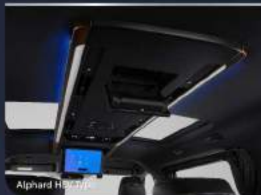
Alphard HEV Type

The luxurious design and advance features including Steering Wheel, MID, Head Unit Display (G & All HEV Type), and DVR (G & All HEV Type) to satisfy you in every drive.